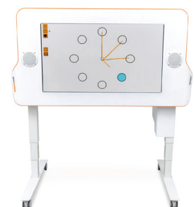
4. Fully tilted eg. hospital bed