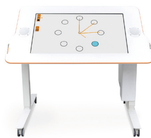
2. Extended for eg. wheelchair