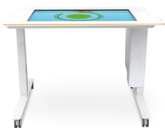
1. Starting Position