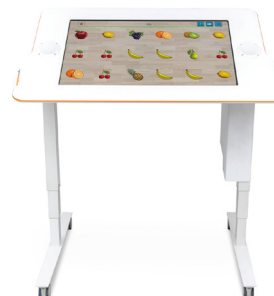
3. Extended and tilted eg. standing